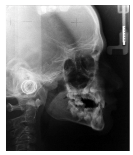
Figure 5: Lateral cephalogram showing skeletal class I malocclusion with orthognathic maxilla and mandible associated with horizontal growth pattern and retroclined upper and lower anteriors

provisional diagnosis of Noonan's syndrome was established after ruling out other differential diagnosis.