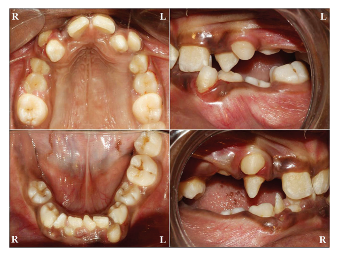
Figure 3: Intraoral views showing multiple submerged and retained deciduous teeth (53, 54, 55, 63, 64, 65, 73, 74, 75, 84, 85) and unerupted permanent teeth (12, 14, 15, 22, 24, 25, 33, 34, 35, 43, 44, 45, 46)