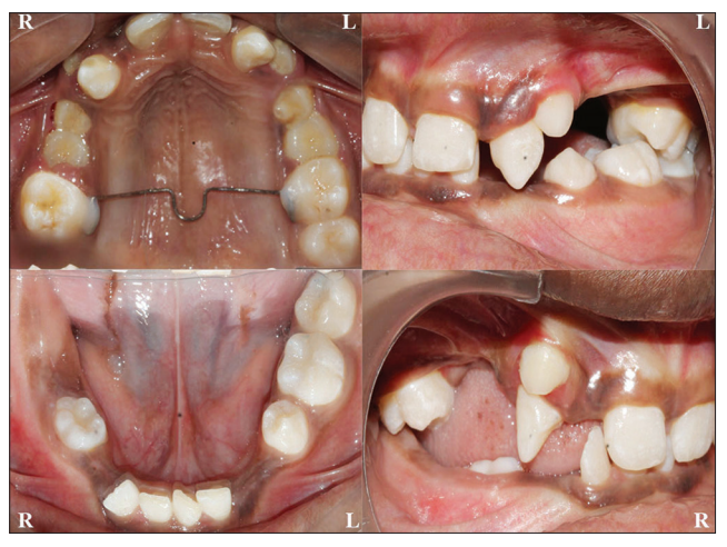
Figure 6: Intraoral postoperative photographs after preventive and corrective treatment

The facial appearance is most characteristic in infancy and early-to-middle childhood and becomes more subtle in