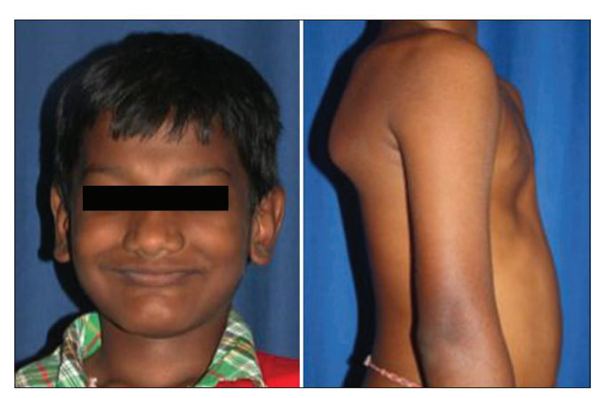
Figure 1: Extraoral profile view showing hypertelorism, flat nasal bridge, saddle nose, mild webbing of neck and lateral view showing pectus excavatum

Orthopantomograph revealed three supernumerary teeth in relation to lower anteriors, congenitally missing (12, 22, 38, and 48) and multiple impacted permanent teeth.