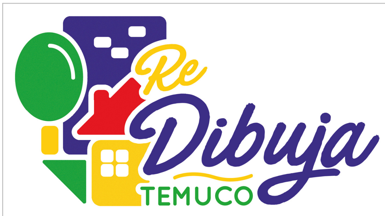
Figure 1. Logo of the REDibuja study.