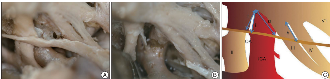
Fig. 2. Operative views (A and B) and a schematic image (C) after extradural anterior clinoidectomy. A : Before releasing the DDR and opening the optic sheath. The distance between the optic strut and the falci-form ligament was checked (f). The distance between the lateral portion of the DDR and the optic strut was checked (g). The distance between the entry of the CN III into the cavernous sinus and the point of intersection with the CN IV was measured (h). B : Operative view after opening of the optic sheath, and releasing of the DDR. The OA was exposed and the distance between its origin and the optic strut is checked (i). DDR : distal dural ring, OA : ophthalmic artery, ICA : internal carotid artery, II : optic nerve, III : oculomotor nerve, IV : trochlear nerve, V1 : ophthalmic branch of trigeminal nerve.