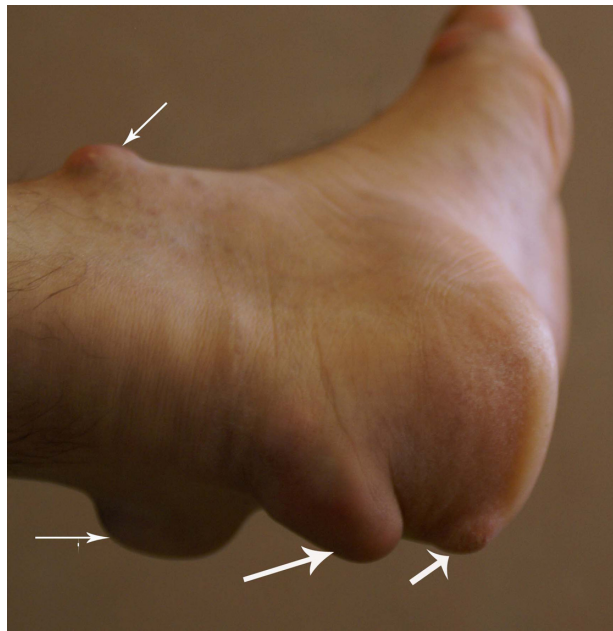
Figure 2 Xanthoma of Achilles tendon in a patient with homozygous familial hypercholesterolemia.

and disadvantages (Table 1). The options include changes in lifestyle and diet regulation, pharmacologic therapy with different categories of drugs affecting various pathways of cholesterol absorption and metabolism and invasive procedures including lifelong lipid apheresis, and finally, liver transplantation.