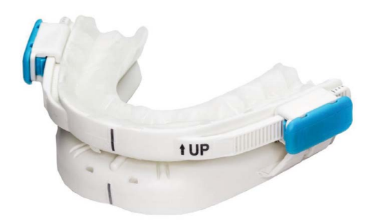
Fig. (1). BluePro® prefabricated adjustable thermoplastic mandibular advancement device.

Each patient was fitted with the PAT-MAD (BluePro®; BlueSom, France; Fig. (1) by their dental practitioner Subsequent PAT-MAD adjustments were made by the patient according to the manufacturer's instructions until snoring ceased or decreased and there was maximum comfortable advancement.