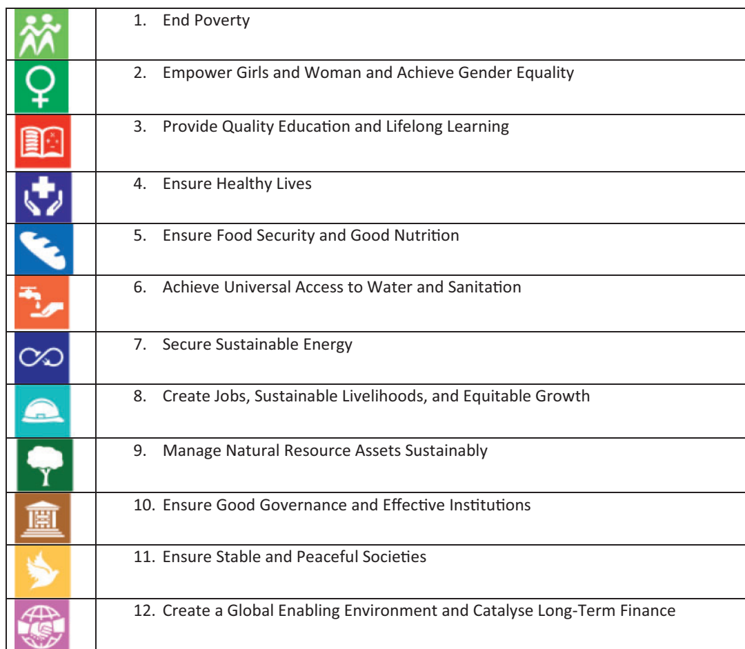
Figure 2. High-Level Panel’s 12 ‘illustrative’ post-2015 SDGs (High-Level Panel 2013).