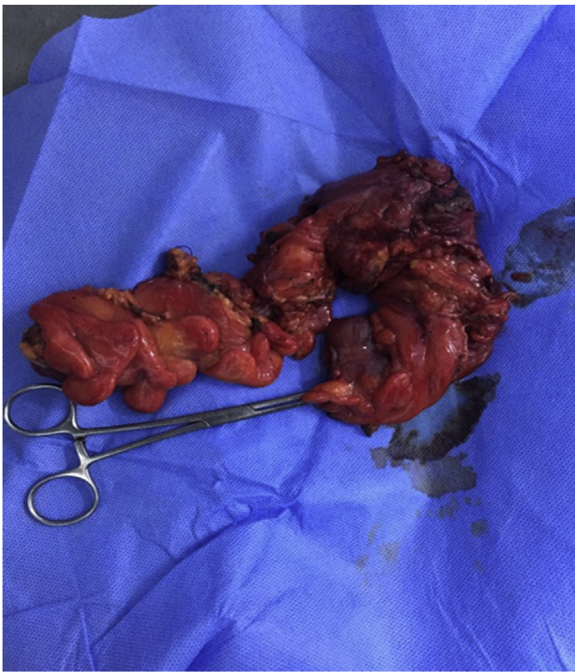
Fig. 1. Ileocecal resection specimen showing a inflammatory and perforated coecum.