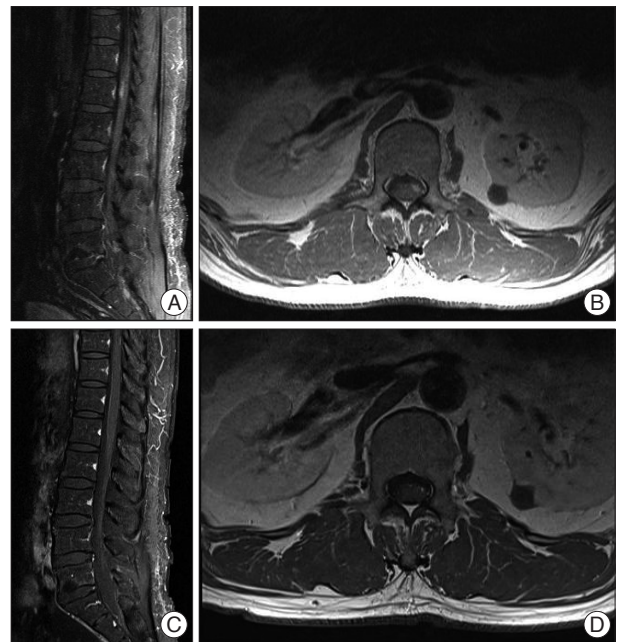
Fig. 2. Follow up magnetic resonance images of the patient. A and B : Gadolinium enhanced sagittal and axial magnetic resonance images done at the third week after re-admission show extensive reduction of the mass lesion. C and D : Gadolinium enhanced sagittal and axial magnetic resonance images reveal complete resolution of mass lesion at sixth week after re-admission.