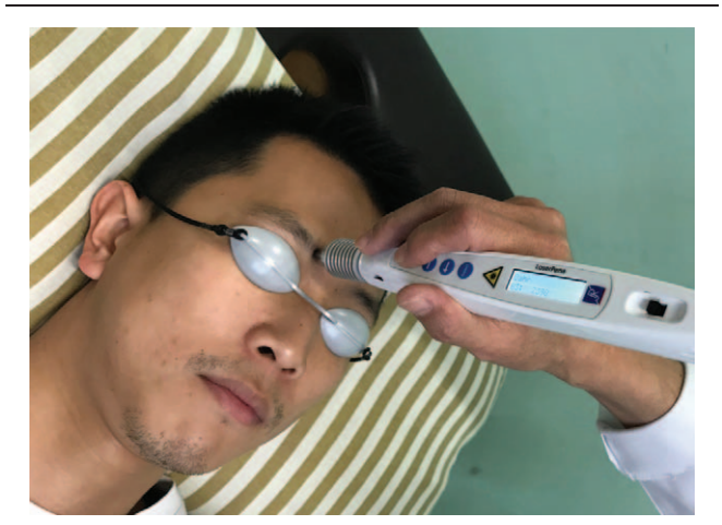
Figure 2. Laser acupuncture performed using the LaserPen device at the BL2 acupoint.

treatment (including Chinese medicine); and those who did not meet the physician's assessment for recruitment or was unwilling to provide informed consent were excluded. In addition, pregnant women were excluded.