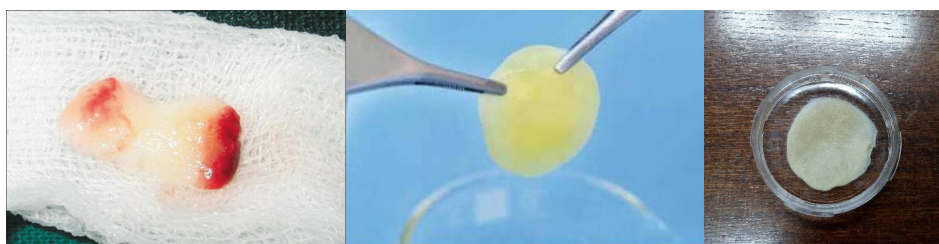
D: Compression of coagulated serum E: Washing prepared Fibrin membrane F: The final fibrin membrane