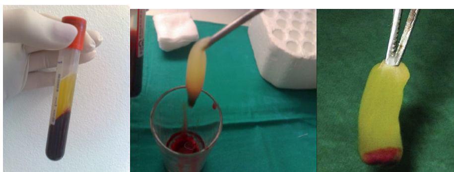
A: Centrifuged blood sample clot B: Coagulated serum separation C: Coagulated serum separation

All fibrin membranes of autoclave group were sterilized at 121 °C (249 °F) for around 15 to 20 minutes and a pressure of approximately 15 psi (Reyhan Teb. 25L).