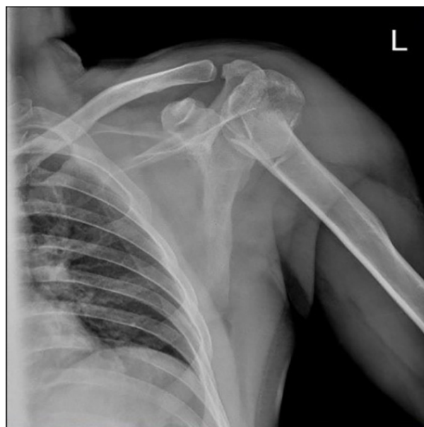
Fig. 2. Preoperative X-ray of the injured shoulder of a patient from the case group.

In the case group, the patients underwent general anesthesia after preoperative preparation and surgical draping. They were placed in a semi-setting position and the roof of the bicipital groove was opened via deltopectoral incisions. Next, the bicipital tendon was cut at 2 cm above the superior edge of the pectoralis major and transferred to the lateral edge of the conjoint tendon, based on the soft tissue side-to-side transfer method. After the fracture was reduced, it was fixed to locking compression plate (LCP) proximal humerus plates (Figure 4). On the other hand, all the steps in the control group except for tendon transfer were similar to the case group and internal fixation was carried out via deltopectoral incisions.