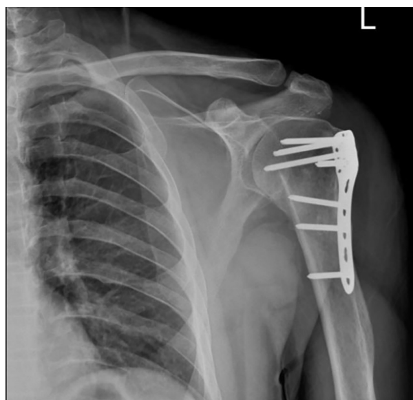
Fig. 4. Postoperative X-ray of a patient from the case group.