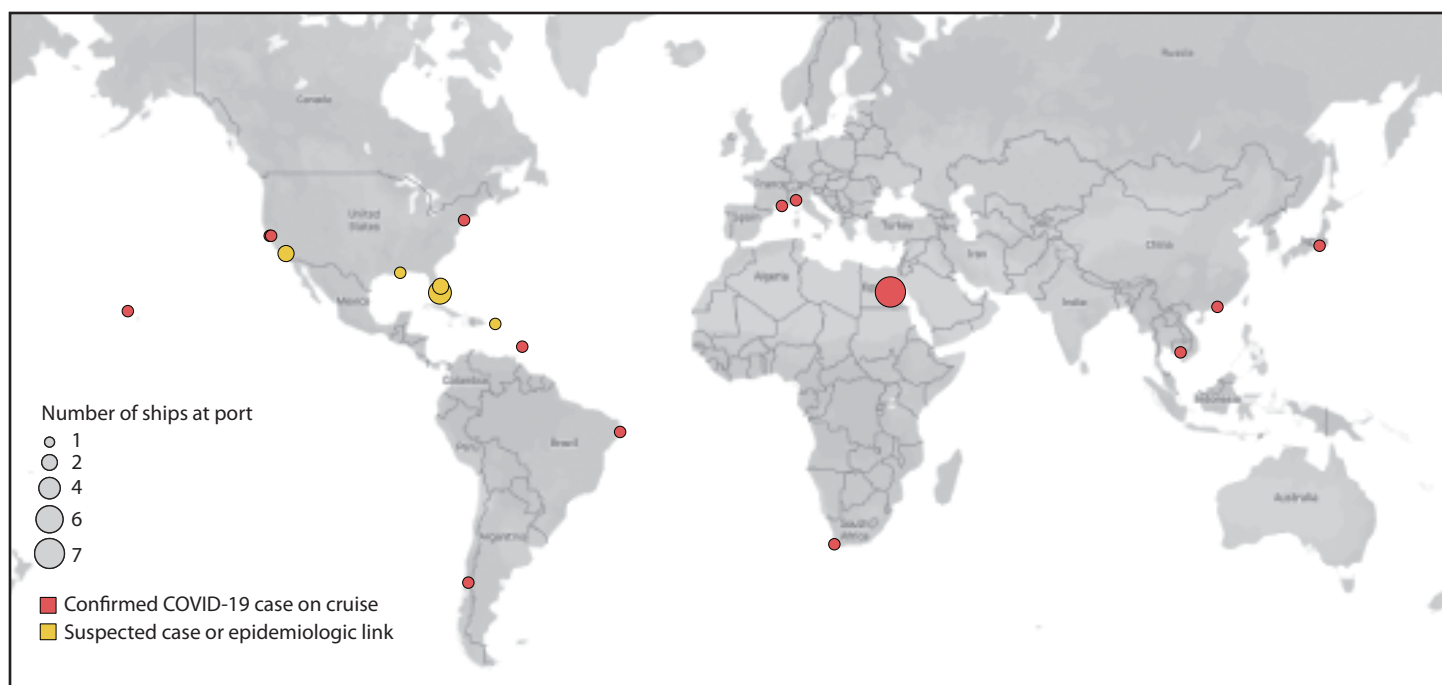
FIGURE 2. Cruise ships with coronavirus disease 2019 (COVID-19) cases requiring public health responses — worldwide, January–March 2020

During the initial stages of the COVID-19 pandemic, the Diamond Princess was the setting of the largest outbreak outside mainland China. Many other cruise ships have since been implicated in SARS-CoV-2 transmission. Factors that facilitate spread on cruise ships might include mingling of travelers from multiple geographic regions and the closed nature of a cruise ship environment. This is particularly concerning for older passengers, who are at increased risk for serious complications of COVID-19 (4). The Grand Princess was an example of perpetuation of transmission from crew members across multiple consecutive voyages and the potential introduction of the virus to passengers and crew on other ships. Public health responses to cruise ship outbreaks require extensive resources. Temporary suspension of cruise ship travel during the current phase of