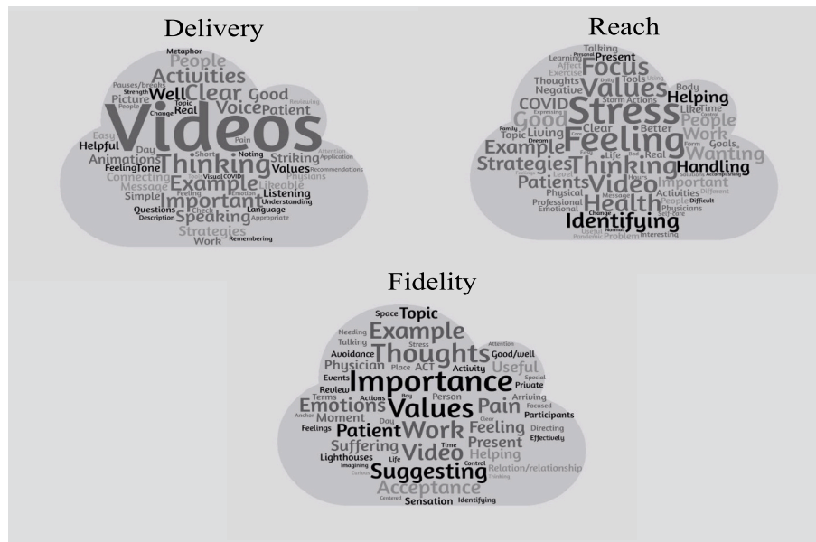
Fig. 2. Word clouds illustrate word count analysis.