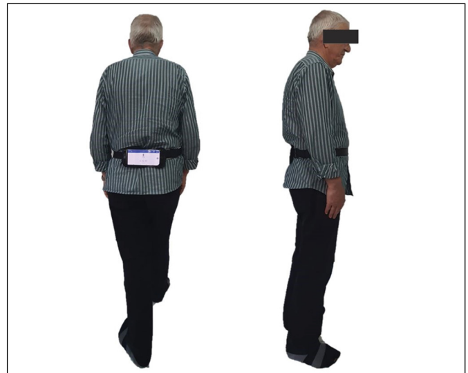
Figure 3. Back and side view of smartphone placed on the body.

No significant difference was observed between the assisted walking times of the patients. No significant difference was observed between the post-operative walking ability and final Harris Hip scores of the 33 IT patients and 36 FN patients without mortality (p>0.05). (Table 2) Smartphone-based gait analysis was applied to 14 patients in the FN group and 12 patients in the IT group who were able to walk without support. The gait velocity, cadence, step time, step length and step time symmetry values were observed to be