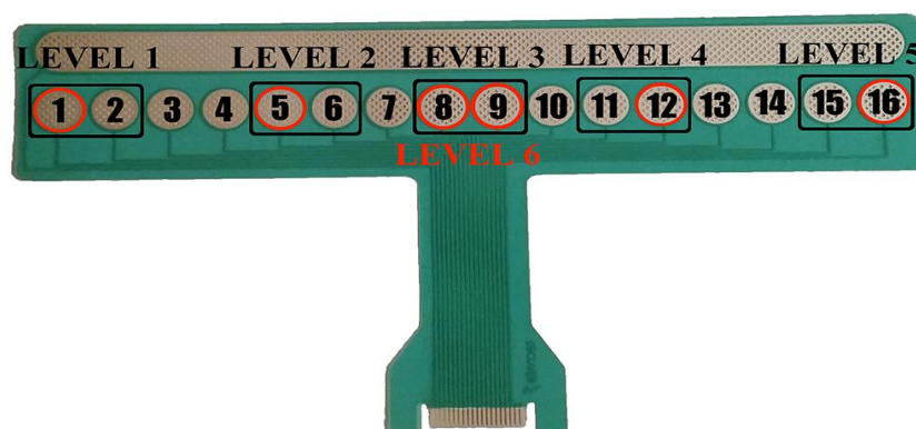
Fig 2. The stimulation array electrode, consists of 16 circular cathodes and a single anode stretching alongside, used for electrotactile feedback. The pads used for feedback mapping are marked with black rectangles (Levels 1 – 5) and red circles (Level 6).

range from 10% to 60% of MVC was mapped as the normalized prosthesis input (0 – 100 %).