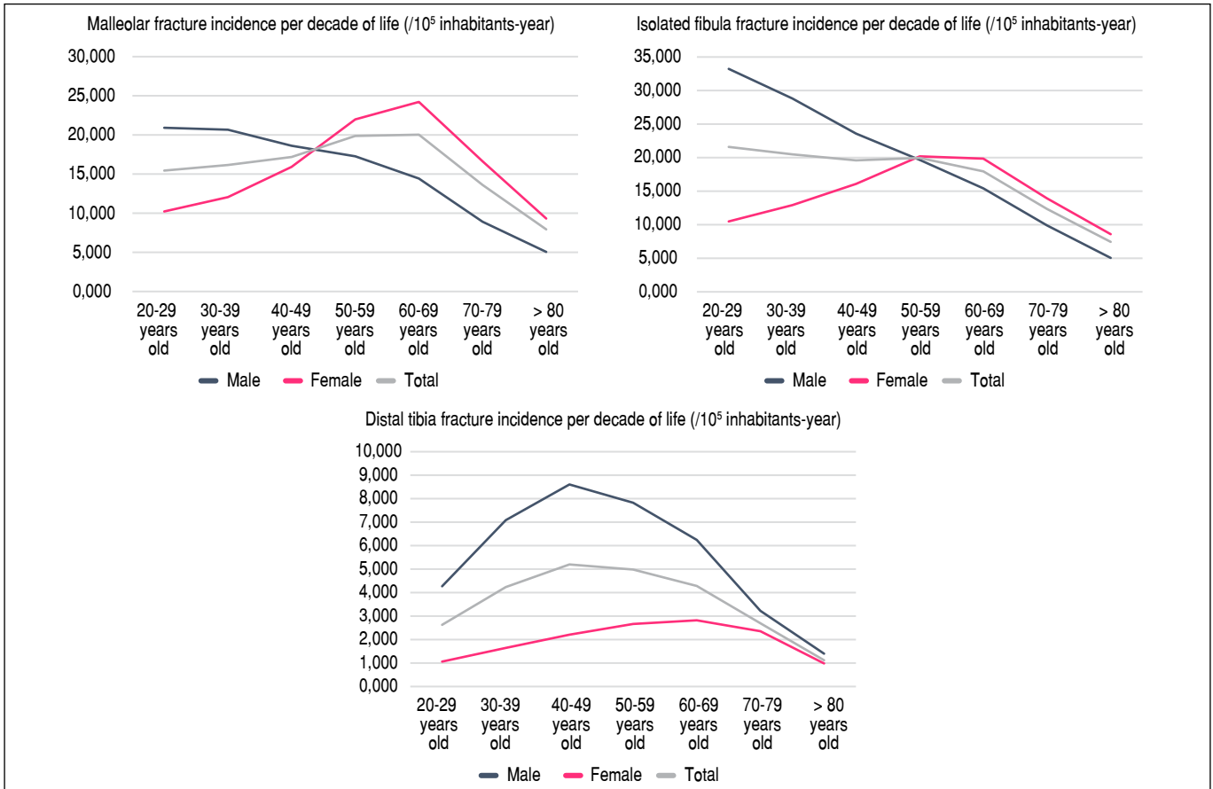
Figure 2. A) Malleolar fracture incidence per decade of life (/10 5 inhabitants-year); B) Isolated fibula fracture incidence per decade of life (/10 5 inhabitants-year); C) Distal tibia fracture incidence per decade of life (/10 5 inhabitants-year).

When analyzing the codes used, we found that the code for distal tibia fractures presented a significantly longer hospital stay (6.78 days – 8.85 days in 2008 to 5.94 days in 2015), whereas the code for malleolar fractures presented an average hospital stay of 4.67 days (5.94 days in 2018 to 3.51 days in 2021) and the code for isolated fibula fracture presented an average of 3.92 days (4.76 days in 2008 to 3.19 days in 2021 – p < 0.001 ).