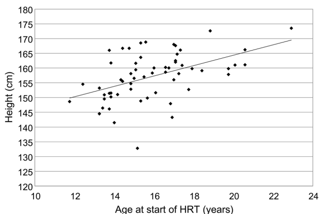
Fig. 1. Correlation between age and height at the start of HRT.