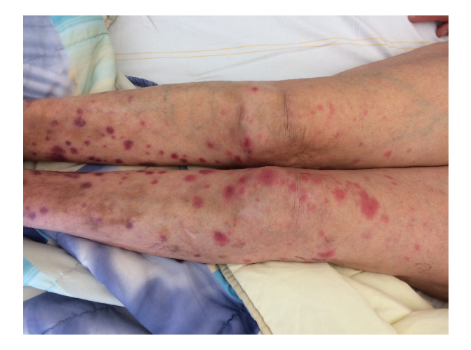
Figure 1. Multiple reddish-purple nodules on the legs of patient A.

significance. Prednisolone treatment was initiated for MDS-EB-2 associated cutaneous PAN.