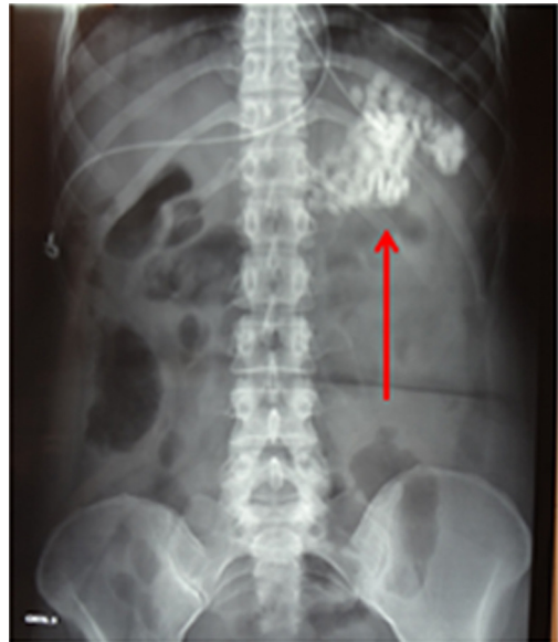
Fig. 1. Abdominal radiography with multiple radioopacities in the stomach (red arrow).

Given her background and the gastric lavage that was ineffective, an abdominal radiography was performed in order to identify the location of the tablets. The radiography showed multiple radiopacities in the stomach and the possibility of a pharmacobezoar was considered. Consultation with the gastroenterology service was done to request an endoscopy for removal of the suspected pharmacobezoar.