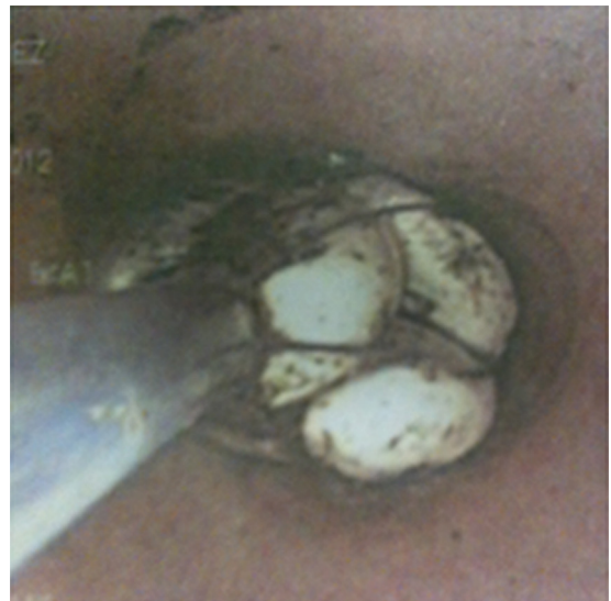
Fig. 2. Endoscopic removal of the tablets.

A total of 99 of the 100 tablets that were either isolated or forming concretions were removed with an endoscopic basket (Figs. 2 and 3).