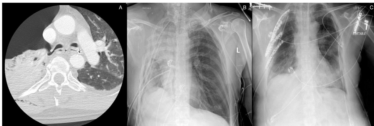
Fig. 2. (A) Axial CT showing complete transection of right mainstem bronchus. (B) Chest X-Ray showing extent of right lung collapse prior to surgery; (C) chest X-ray on post-op day 11.

resection, but given the long time period from the original injury, lack of ventilation and possible contusion versus pneumonia to the right upper lobe, and the patient's excellent baseline functional status, the decision was made to resect the right upper lobe. The right upper lobe bronchial stump was closed primarily with interrupted 4-0 vicryl sutures (Fig. 3B). The superior pulmonary vein branches to the upper lobe were isolated and divided. Next, the pulmonary artery branches to the upper lobe with the truncus and posterior segmental branches were isolated and divided. The major and minor fissures were resected with several stapler loads to complete the right upper lobectomy. After ensuring that the air leak tests were negative, the azygos vein was divided and oversewn over the top of the bronchial stump for protection (Fig. 3C). Following the azygos vein flap placement, rib fixation was performed. Numerous fractures were found throughout ribs 3, 4, 5, and 6. These were then plated across the rib interspaces using the Synthese© rib plating system. Afterwards, two chest tubes were placed through the old chest tube insertion sites.