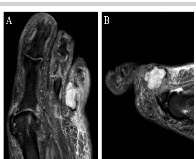
Figure 2: STIR MRI with and without contrast showed a soft-tissue mass expanding through the cortex with cortical destruction of the left third proximal phalanx in the (a) axial and (b) sagittal views.

Microscopic analysis of the biopsy specimen showed the tumor consisted of anastomosing cords of reniform cells characterized by a thin rim of eosinophilic cytoplasm and present within a myxoid stroma. Nuclei were ovoid with prominent nuclear