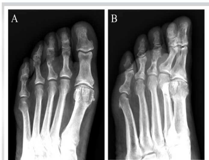
Figure 1: Anteroposterior (a) and anteroposterior oblique internally rotated (b) radiographs of the left third proximal phalanx show a fractured lytic lesion with cortical erosion and soft-tissue shadowing.

(estrogen receptor positive) treated with radiation therapy and long-term use of selective estrogen receptor modulators. Notable family medical history includes colon cancer in her mother and prostate cancer in her father.