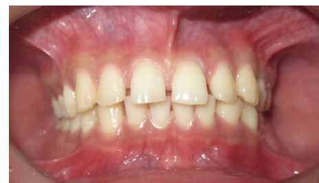
FIGURE 3: IOTN-AC Grade 5–7: borderline/moderate need for orthodontic treatment.

The results of this study indicated that the orthodontist’s assessment was dissimilar with the subject’s perception. More subjects perceive that they do not need orthodontic treatment as compared to orthodontist’s assessment for “no need” group. The reason may be that layperson tends to have a less critical view of the same malocclusions assessed by the professionals as supported by Shaw et al. [14], Hunt et al. [21], Trivedi et al. [22], and Graber and Lucker [23]. For moderate need group, again there was disparity in orthodontist’s assessment and subject perception with less subjects perceiving moderate need as compared to orthodontist. The reason may be the difficulty for the general population to differentiate between the features of malocclusions such as deep bite and increased overjet while seeing the photograph which is only understood by an expert and is rated in treatment need grade of AC. For definite need group the patients perceived them of having more severe malocclusion as compared to orthodontists and are consistent with Reichmuth et al. [24] who found that subjects rated themselves as having worse occlusion in publicly funded clinics. In this study, it appeared