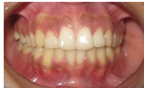
FIGURE 2: IOTN-AC Grade 1–4: no need for treatment.