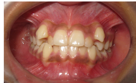
FIGURE 4: IOTN-AC Grade 8–10: definite need for orthodontic treatment.

that the gender and age had no significant relation which is similar to the study done by Albarakati [1] in Saudi Arabia. A study done by Aikins et al. [25] to check the self-perception of malocclusion among Nigerian adolescents found that there was no significant relation with respect to gender but adolescents aged 16–18 had an increased level of perception of need. Further, in the same study, males were found to be more in need of treatment by orthodontist. Al-Balkhi and Al-Zahrani [26] also found lack of significant difference between both genders. On the contrary, Burden and Holmes [27] found that there were significantly more males than females who were in need for orthodontics treatment. The present study shows insignificant relation toward the level of education in relation to the perception of subject and the assessment of orthodontist. Unlike the study done by Bellot-Arcís et al. [28] in a Spanish adult population in which it was found that