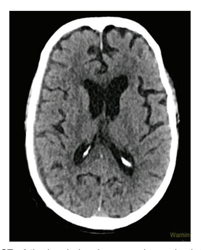
Figure 2: NCCT of the head showing a nearly resolved right subdural hematoma without any parenchymal insult

An extensive literature review did not reveal any case of brivaracetam-induced encephalopathy and we report the first such occurrence. Our case was challenging to manage as he suffered from rarities abound. Subdural hematoma is a known risk factor for status epilepticus with a prevalence of 0.5%.<sup>[1]</sup> Valproate and phenytoin were not used in this patient due to their Cytochrome P450 (CYP) inhibiting and inducing properties, respectively,<sup>[2]</sup> because of his multiple comorbidities and treatments and the eventual need for anticoagulation due to non-valvular atrial fibrillation (CHADS2VaSc score-4).<sup>[3]</sup> Phenvtoin was not given its adverse effect on cardiac conduction.<sup>[4]</sup> Although lacosamide can have similar conduction defects, it seemed like the safer alternative between the two and was well-tolerated.<sup>[5]</sup> Levetiracetam is a relatively well-tolerated anti-seizure medication (ASM). Hyperammonemia has been reported extremely rarely<sup>[6]</sup> and is relatively commoner in individuals with renal failure. Our patient tolerated levetiracetam well but developed hyperammonemic encephalopathy with brivaracetam, and had a complete recovery with its cessation.