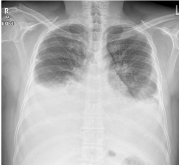
FIGURE 1 Chest X-ray on presentation showing bilateral pleural effusion

bilateral axillary and mediastinal lymphadenopathy, and both lungs were clear with no pleural effusion.