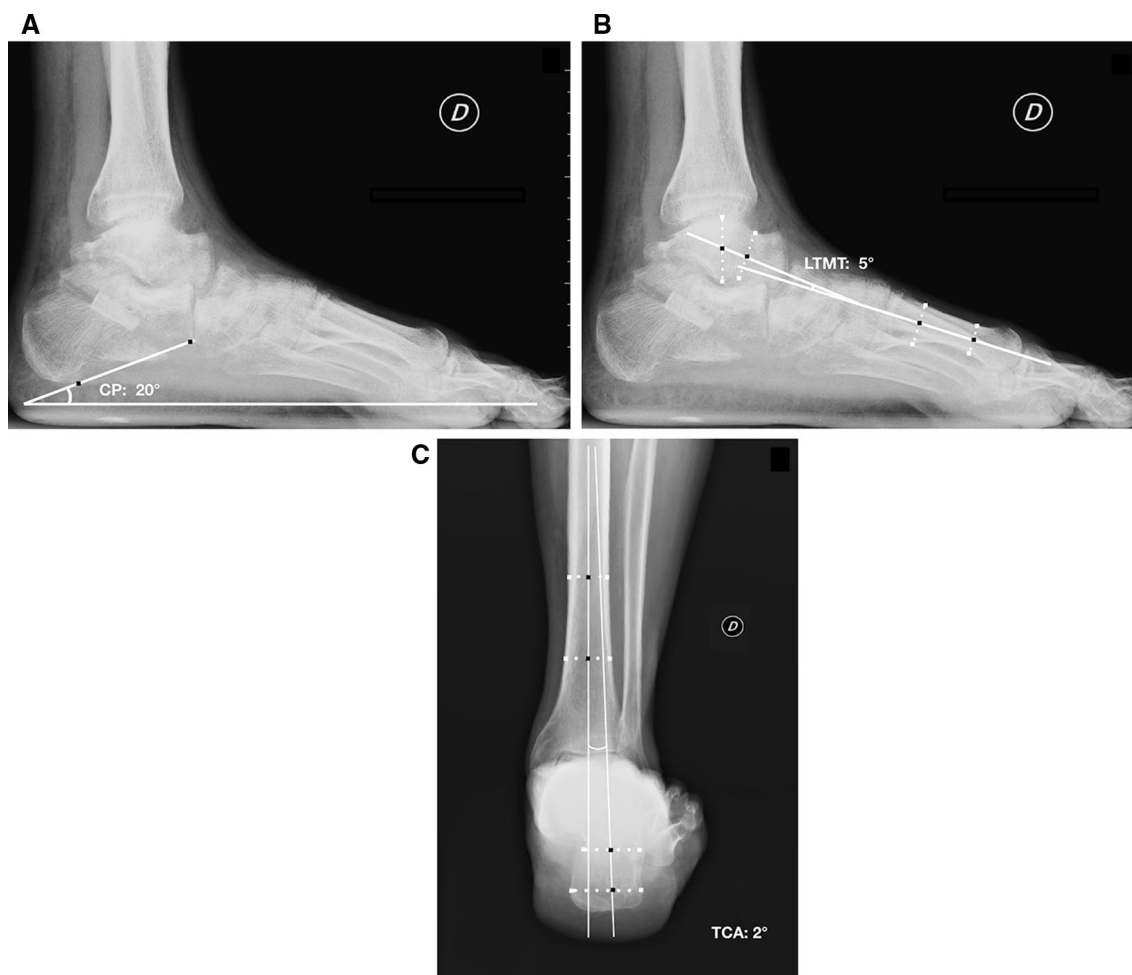
Fig. 2 Weight-bearing lateral view of the same patient 3 months after calcaneal osteotomy with allograft augmentation and TAT and TPT tenodesis. The improvement of calcaneal pitch (CP) ( a ) and talo–first

metatarsal angles b is measured and the Saltzman view c shows the reduction of tibio-calcaneal angle (TCA)