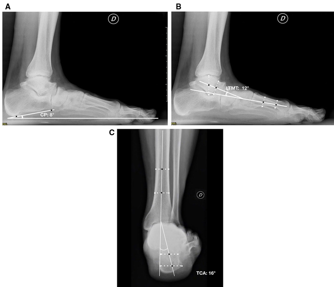
Fig. 1 preoperative weight-bearing lateral view of a 68-year-old male patient with AAFD. The X rays show the assessment of calcaneal pitch (CP) (a) and talo–first metatarsal (LTMT) angles (b). The Saltz-

man view c shows the tibio-calcaneal angle (TCA) as a measurement of hindfoot alignment