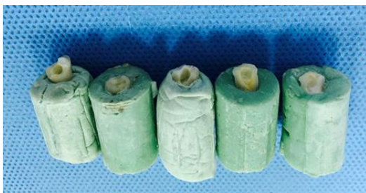
Fig. 3. Repairable fracture (above the CEJ)