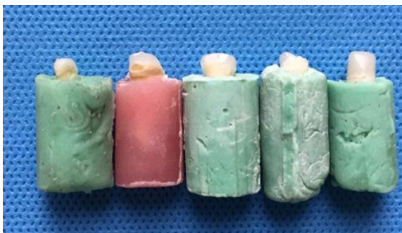
Fig. 4. Irreparable fracture (below the CEJ)