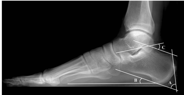
Fig. 3 Radiographic indices evaluated using standing lateral foot radiograph. a Fowler-Philip angle. b Calcaneal pitch angle. c Bohler's angle

Table 1. There was no significant difference between the two groups in terms of demographic parameters.