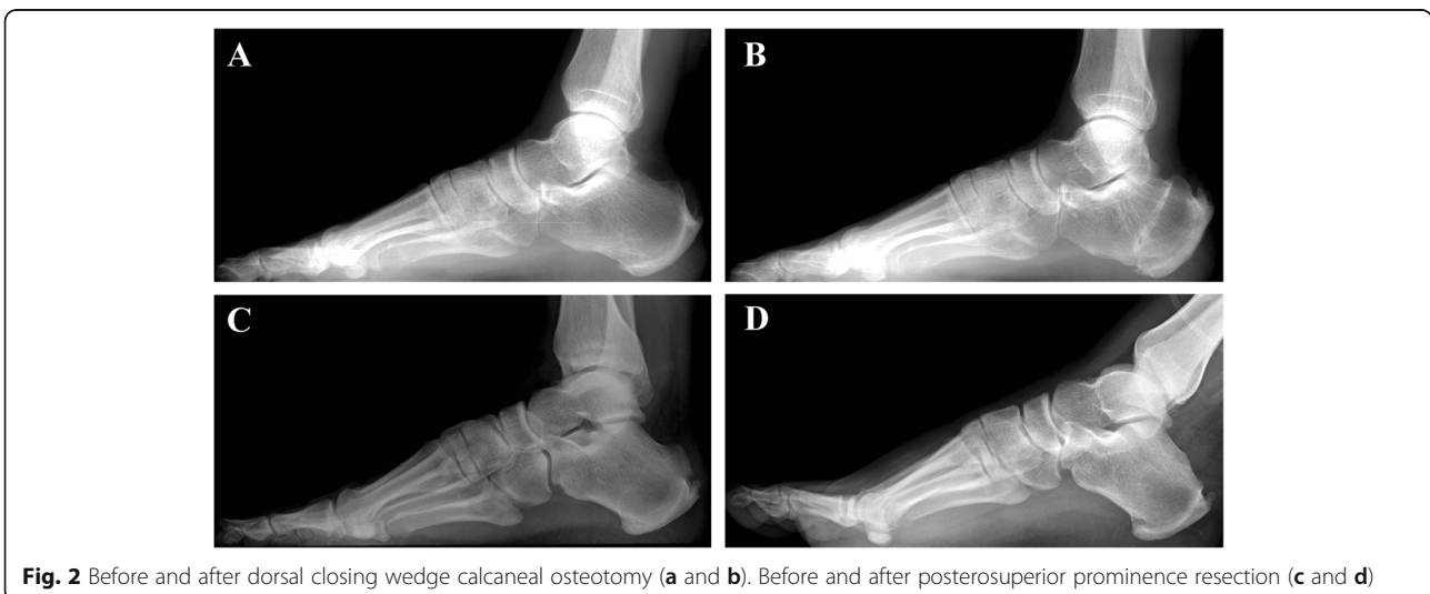
Fig. 2 Before and after dorsal closing wedge calcaneal osteotomy (a and b). Before and after posterosuperior prominence resection (c and d)

The series included a total of 44 patients; 12 patients comprised the DCWCO group and the other 32 comprised the PPR group. All patients were normal people, but not athletes, keeping a moderate amount of exercise. Patient demographics, including age, sex, BMI, operative side, smoking, and follow-up time, are summarized in