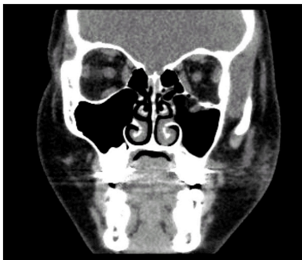
Figure 1 Coronal CT imaging of a pediatric patient with a left orbital floor greenstick fracture.

In general, it is prudent to obtain orbital imaging in all patients who suffer orbital trauma. Holmgren et al found that 12% of the trauma patients who had a head computed tomography (CT) also had a maxillofacial fracture. 19 Additionally, he found that upon review of axial CT images of head, orbital fractures were commonly identified. 19