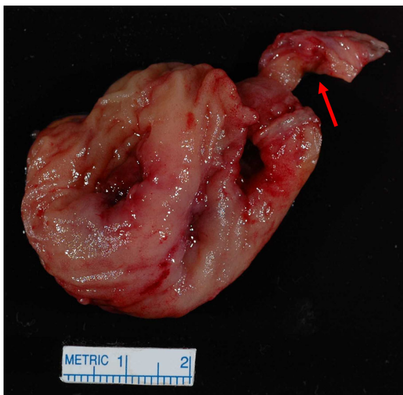
Figure 4 Gross pathology specimen of the patient's resected bowel reveals a Meckel's diverticulum (arrow) with perforation at its tip, attached to the small intestine.

Complications in patients with Meckel's diverticulum are rare; most patients remain asymptomatic for life [3]. In both adults and children, intestinal obstruction and bleeding have been reported to be two of the most common complications of a Meckel's diverticulum [3-6]. Small bowel obstructions related to Meckel's diverticulum have been reported due to intussusception, incarceration in a hernia sac, or entrapment by an adhesive band, or as being secondary to neoplasm [7]. The pre-operative diagnosis of a patient with Meckel's diverticulum often presents a challenge to the clinician in both children and adults, because presenting symptoms can be non-specific and the differential diagnosis broad [4].