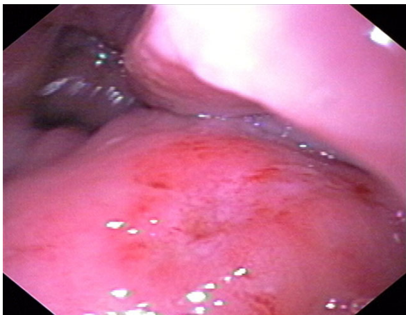
Figure 2 Endoscopic view of the rectosigmoid mucosa demonstrates erythema and edema, with luminal narrowing due to multiple areas of extrinsic compression from the abscess.

We report a complicated and unusual case of a patient with a perforated Meckel's diverticulum who presented with obstipation and urinary retention. The patient required an open laparotomy for definitive diagnosis and management.