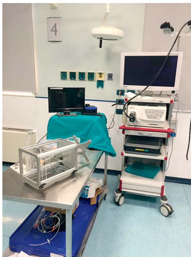
► Fig. 2 Standard setting of the ERCP Trainer with simulated fluoroscopy (camera on the top of the ERCP Trainer).

nulation starts. In this way the operator trainee learns to listen and the assistant trainee to teach. During the training session, the two trainees swap roles (► Fig. 3 ). We perform blind-eye cannulation at the end of every ERCP training sessions on the ERCP Trainer and it is always supervised by expert trainers. The blind-folded trainee learns to follow instruction and the assis-