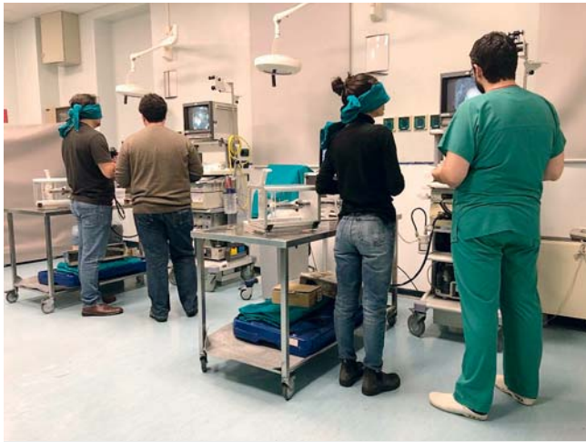
► Fig. 3 Blind-eye cannulation for ERCP training.

tant trainee acquires a better understanding of the techniques needed to achieve cannulation. In addition, to the best of our knowledge, this is the first report of an eyes-blinded type of training for all medical and non-medical sciences.