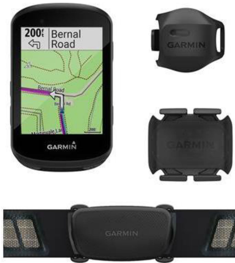
Figure 2: The study sensors and Garmin Edge 520 bike computer