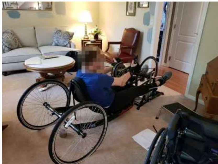
Figure 1: Example training setups for the add-on handbike (top) and handcycle (bottom)