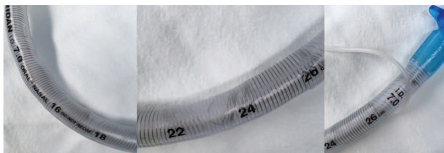
Figure 2. Distortion of the metal frame is evident between depth marks 16 and 18, 22 and 24, and over 26.

ETT intubation is an essential element of general anesthesia and is needed for accurate testing to establish a secure airway. High PIP after ETT intubation can be caused by various factors such as respiratory disease and position, operation type, and problems with the ventilator or airway equipment. [1] Among possible