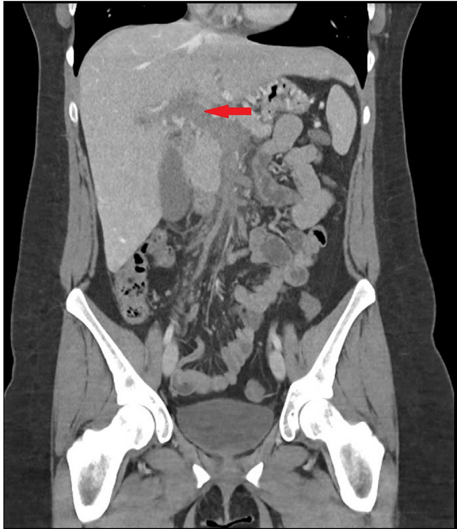
FIGURE 1: Initial CT imaging

She reported partial improvement with her symptoms over the following weeks.