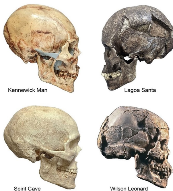
Figure 3. Examples of other Pale Indians. All but the Wilson Leonard individual are males.