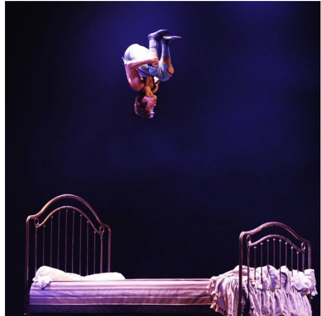
Figure 1. A performance acrobat defies gravity on the trampobed

While one of the earliest studies on injuries in the circus performer population found injury rate to be lower in comparison to similar sport disciplines within the National Collegiate Athletic Association, 1 research on this unique and diversified demographic has evolved. 2,3 With show opportunities expanding and performers becoming more specialized, injury risk is more apparent and worthy of further discussion and investigation. 2,3 Performance in circus requires high workloads through repetitive training and frequent show performance exposures which creates injury risk comparable to that in sports, with 7.3 to 9.7 injuries per 1000 artist performances. 1-3,5 These injury rates in circus are comparable to those found in a study of practice injuries in NCAA sports, in particular Fall season sports which demonstrated injury rates of 7.4 injuries per 1000 exposures with the highest injury risk sport being women's soccer at 9.3 injuries per 1000 exposures. 5 The diversity of disciplines