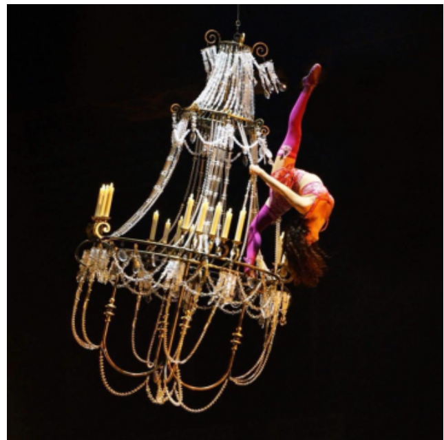
Figure 2. A contortion artist challenges the limits of flexibility on the aerial chandelier

within both acrobatic and non-acrobatic performer profiles further influences a unique variety of injury conditions and presentations which require creativity while progressing an injured performer back to show performance. 1-4 These high workloads within circus performance require frequent, repetitive movements and dynamically loaded patterns through extreme ranges of motion which contribute significantly to time-loss from training and performance due to a variety of acute, traumatic, and chronic injuries. 1,2,6