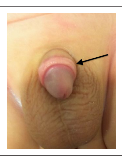
Figure 1 A nicely healed wound after regular retraction following a slipped plastibell ring and bleeding immediately after the circumcision