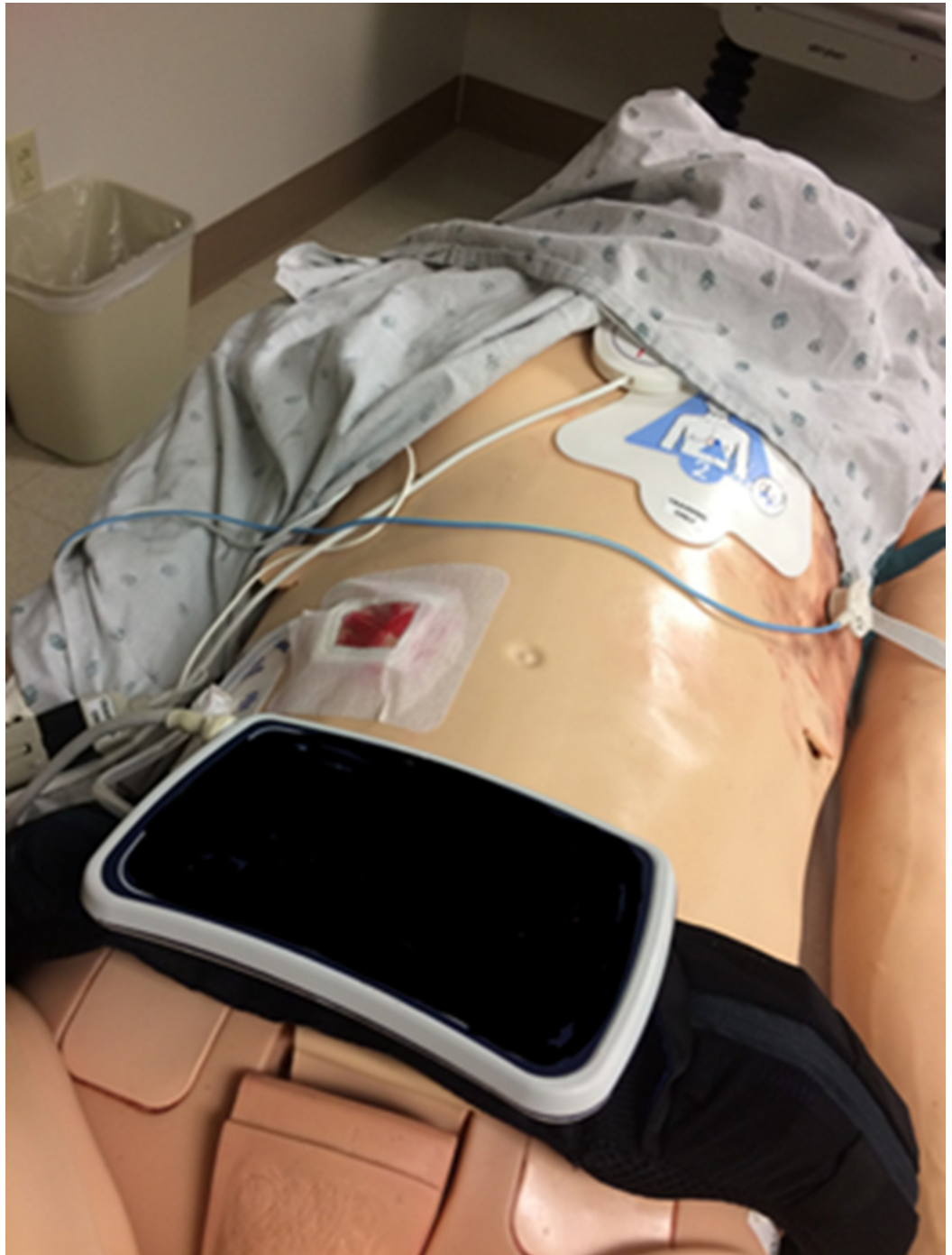
FIGURE 5: The controller resting in the middle of the battery packs

The Sorbaview 2000 window dressing piece was then adhered to the right mid-abdomen with the Foley catheter portion feeding out laterally connecting to the simulated controller (Figure 6). The driveline may exit a patient from either their right or left abdomen to connect to the controller [4].