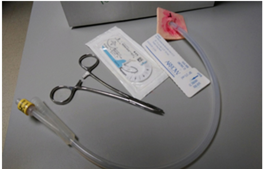
FIGURE 2: Foley catheter attached to the manikin-like material with suture and hemostat

A Bardex 20-French silicone Foley catheter (Bard Medical, Covington, GA, USA) was used to represent the driveline coming from the patient's abdomen and connecting to the controller. The Foley catheter (Figure 2) with the tip removed was then inserted through a small cut in the dressing and sutured in place with black Ethicon braided suture on the manikin material along the edge of the window (Figure 1).