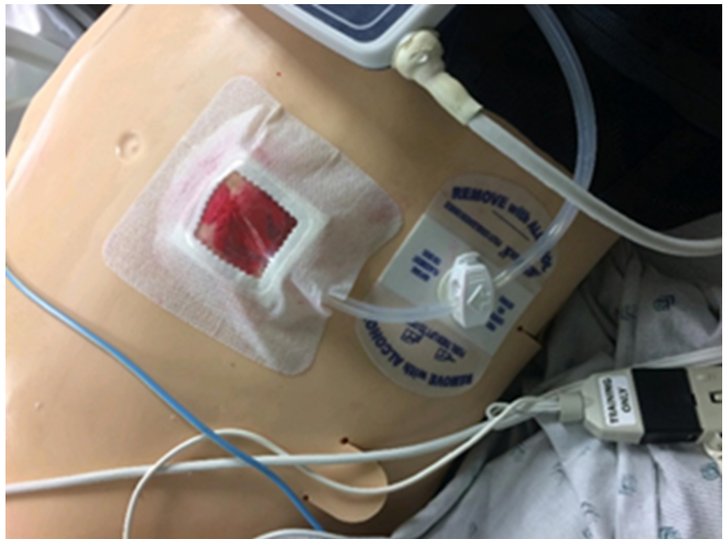
FIGURE 6: The cloth tape dressing in place on the right abdomen

Finally, an electric toothbrush was placed in the manikin's chest cavity and turned on to represent the LVAD pump functioning within the heart, creating the continuous hum that would be heard when auscultating these patients (Figure 7).