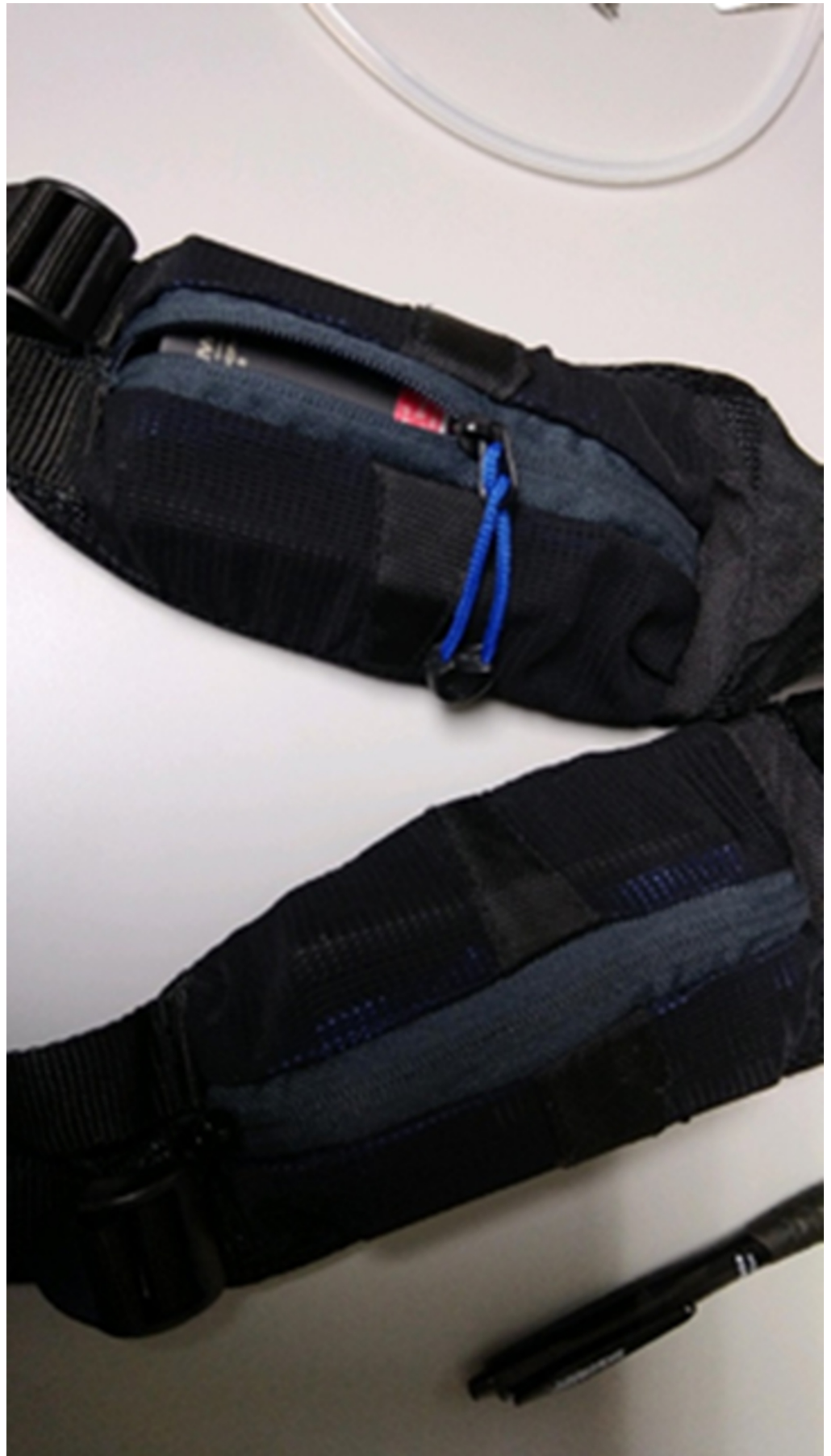
FIGURE 4: The simulated battery pack with a spare pack