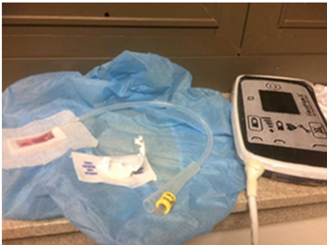
FIGURE 3: The printed controller panel attached to the hospital bed remote

Two large squared batteries, taken from an Audio-Technica wireless microphone receiver (Audio-Technica Corp., Tokyo, Japan), were then placed in the waist packs from a hiking backpack (Figure 4) to represent the primary battery and the backup most patients will carry at all times. A fanny pack with dual pockets may also serve as the battery containers. The LVAD controller was then connected to the front of the waist packs between the batteries (Figure 5).