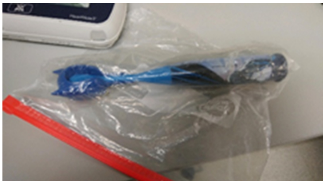
FIGURE 7: The mechanical toothbrush used to represent the pump

Finally, an electric toothbrush was placed in the manikin's chest cavity and turned on to represent the LVAD pump functioning within the heart, creating the continuous hum that would be heard when auscultating these patients (Figure 7).