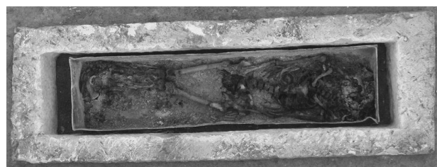
Fig. 2. South sarcophagus F293 with the individual in the lead coffin.

Only 1 individual yielded positive results. The analysis of sediment taken from the surface of the sacrum of the individual in coffin F293 (sample JC_FC_689, Table 1) revealed the presence of 2 ovoid eggs, characterized by 2 polar plugs giving them a characteristic lemon shape (Fig. 3). Egg sizes without polar plugs were 46.4 \mu m long and 25.2 \mu m wide for the first (Fig. 3A) and 54.5 \mu m long and 26.4 \mu m wide for the second (Fig. 3B). Because of the size (consistent with current data) and the archaeological context, these eggs were identified as