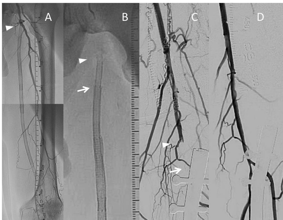
Fig. 1 Case 1 angiographic images. Angiography revealing total occlusion of three Viabahn endografts in the superficial femoral artery (A, B). Digital subtraction angiography revealing a filling defect in popliteal artery (arrowhead), above the filter (arrow) following utilization of the Jetstream XC device (C). Flow was effectively restored after filter removal and administration of intra-arterial vasodilators (D).

An 85-year-old female was admitted to our hospital with acute onset of resting left foot pain (Rutherford classification 2b). She had a history of atrial fibrillation on Coumadin therapy, ischemic strokes and peripheral artery disease with multiple prior percutaneous endovascular interventions including placement of 2 Viabahn endograft stents in the left SFA for diffuse in-stent disease (5.0×100 mm and 5.0×150 mm, W. L. Gore & Associates, Flagstaff, AZ, USA). Given the acute nature of symptoms she was referred for urgent angiography which confirmed an acute thrombotic occlusion of the Viabahn endografts extending from the ostium of the left SFA to the proximal portion of the left popliteal artery (Fig. 2A). Upon confirming an international normalized ratio (INR) of 2.7 and having a multi-disciplinary team discussion, we proceeded with an