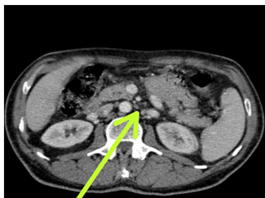
Fig. 1. Abdominal CT showing A Complex mass lesion in the tail of the pancreas.