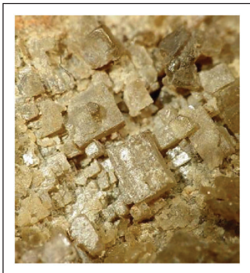
Figure 2. Calomel from Mariposa Mine, Texas, USA.

Mediterranean world for extracting metals by amalgamation as early as 500 BC. 6 The element does not have any known biological functions 8 and has a long history of toxic effects. 6 Mercury(II) chloride ( \text{HgCl}_2 ), for instance, which was probably first made by Arabic alchemists in the 10th century, 9 was widely used as a violent poison in the Middle Ages. 6 Do the mercury mines in western Turkey contain any mercury species that look like gold?