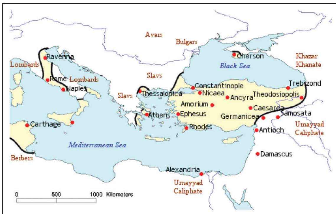
Figure 1. Map of the Byzantine Empire in 668. (Chris Ambrose, explore Byzantium, http://byzantium.seashell.net.nz/ , is credited for the image.)

The mainland of the Byzantine Empire in 668 (about one year before al-Hasan’s death) was approximately present-day Turkey (Figure 1). In present-day western Turkey, there are more than 50 mines that contain minerals with deposits of mercury. 7 Mercury is isolated from its main ore, cinnabar (mercury(II) sulfide, HgS), and was used in the