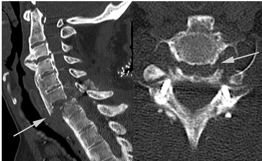
Figure 2 Computed tomography scan of our patient's cervical spine obtained on admission to our institution. The scan shows a persistent luxated position of the fracture at level C6/7 after dorsal stabilization at the outside hospital.

seen by Schmitz et al. and Ea et al. , respectively [6,19]. Kewalramani et al. reported two cases in their series of three [9]. In 1976, Rinsky and colleagues have published a