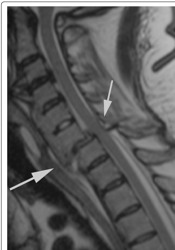
Figure 1 T2-weighted MRI scan in a median-sagittal plane of the cervical spine. There is a C 6/7 luxation fracture without evidence for a profound spinal cord lesion. The degenerative alterations, particularly the large bridging spondylophytes are consistent with Forestier's disease.

At two-month follow-up, our patient reported satisfaction with the outcome. His inflammatory parameters had normalized and all the incisions looked well healed. He had an acceptable range of movement of his cervical spine. While his left upper extremity had full sensorimotor function, on his right side function was still impaired. At six-month follow-up, persistent but slightly improving neurological deficits were recorded. Figure 3 shows radiographic imaging results obtained at the six-month follow-up demonstrating no changes in alignment, intact hardware and osseous consolidation. Subsequent to the last follow-up, our patient was still undergoing ergotherapeutic and physiotherapeutic therapy addressing his right upper extremity limitations.