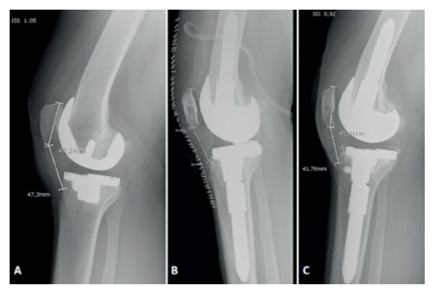
Figure 2. Patella's position on lateral view x-rays of the same patient before rTKA (A), after rTKA (B) and at last-36 months FU (C). ISI ranged between 1.05 before revision surgery and 0.92 at last FU. LARS ligament to reinforce patellar tendon was fixed to proximal tibia using an anchor 2 months after rTKA (C).

thickness was 127.12%. Only one knee (one patient) presented radiolucent lines around tibial stem without any symptom.