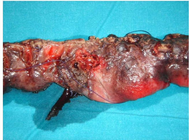
Figure 2 Photograph of the surgical specimen.

The patient underwent laparotomy and 30 cm of small bowel with multiple areas of damage was found. The damage included macroscopically a rigid and thickened mass in the ileal portion, creeping fat, multiple granulomas in the external intestinal surface and ulcers, two of which had parietal ruptures with fluid escape. A resection of 45 cm of the ileo-jejunal portion, including all areas of intestinal damage, was performed and a primary end to end ileo-jejunal anastomosis completed the operation (Figure 2). Longitudinal incision of the intestine showed a cobblestone appearance, due to linear ulcers crossing with transverse folds. Linear ulcers were created from interconnected rows of aphthous ulcers. A characteristic large pseudopolyp, 4 cm in diameter, was in the obstructed portion of the mass.