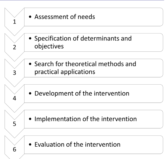
Figure 2 The six steps of the intervention mapping framework.

The data collection takes place during the period 2020–2024 (see figure 1). For development of the toolbox, the six steps of the intervention mapping (IM) framework are followed: (1) assessing the needs of the target group, (2) specifying the problem and its determinants into change objectives, (3) selecting theoretical intervention methods and practical applications for change, (4) designing and developing the intervention, (5) implementing the