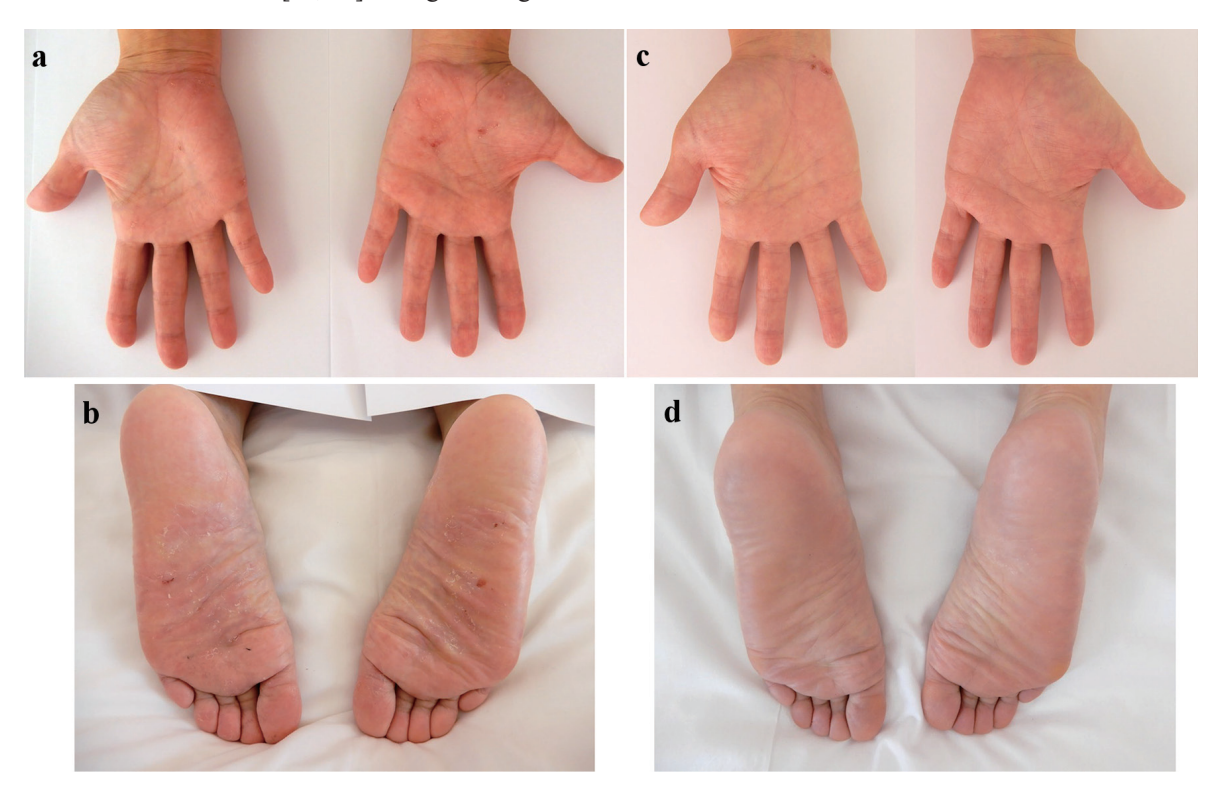
Figure 2. Skin findings of palmoplantar pustulosis on the palms and soles. A small number of blisters and pustules, and scattered scales on diffuse erythematous skin were present on both the palms (a) and soles (b) on admission. At 8 weeks after starting ustekinumab, focal scale is present on the right palm (c) without blisters, pustules, scales, or erythema on the left palm and both soles (c, d).

IL-23 are considered efficacious for PPP. Guselkumab blocks IL-23 signals by targeting the 19-protein subunit of IL-23. The efficacy of guselkumab in patients with psoriasis [31, 32] and PPP [13, 33] has been demonstrated very recently. Moreover, CD and psoriasis share the common IL-23/Th17/IL-17 pathway in the disease pathogenesis, as demonstrated by the efficacy of biologic treatments targeting this pathway in CD [16]. The IL-12/23 subunit p40 antagonist (ustekinumab) has also been shown to be effective for PPP in addition to hidradenitis suppu-