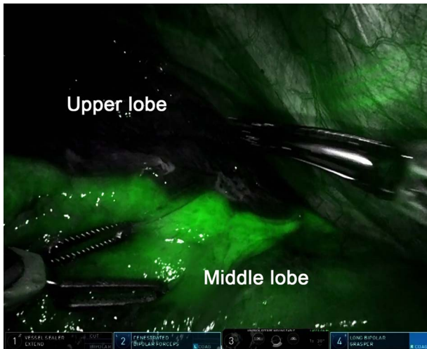
Figure 2: Intravenous indocyanine green delineation of the interlobar border between the right upper and middle lobe.

After injecting, the surgical field was visualized with the integrated fluorescence imaging capability of the Firefly Fluorescence Imaging camera (Intuitive Surgical) (Fig. 2). The interlobar border was then identified as the line separating the dark lung parenchyma from the green lung parenchyma. The border was marked on the visceral pleura using a long bipolar grasper and divided by robotic staplers. The resected lobe was extracted after mediastinal node dissection. The total operation time was 2 h 38 min, and the console time was 1 h 34 min. There was minimal blood loss. The operation was completed without complications, and the postoperative course was uneventful.