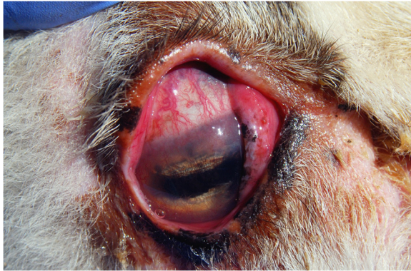
Figure 2 One of the more severe IKC cases observed during the study period, eye of a domestic sheep from the Pyrenees showing epiphora, conjunctival hyperemia, peripheral corneal edema, and neovascularization.

sampling periods (Table 1) indicate that M. conjunctivae infection is widespread among domestic sheep in the Pyrenees, endemic and self-maintained within domestic sheep flocks. This agrees with previous data on M. conjunctivae prevalence (25.8%) in domestic small ruminants from Central Pyrenees [12] and the wide distribution of M. conjunctivae infection in domestic sheep throughout Europe [4,7]. In contrast, the lower prevalence found in the Cantabrian Mountains and the fact that M. conjunctivae was detected in only one flock in this region suggest that M. conjunctivae is currently less common in this area. Moreover, the only M. conjunctivae -positive flock in the Cantabrian Mountains seasonally migrates to Caceres (South-Western Spain) in winter. Hence, the origin of M. conjunctivae in this flock is unclear and could lead to an overestimation of the endemic situation of M. conjunctivae in this region. Furthermore, the occurrence of M. conjunctivae relative to IKC cases in the two study areas strongly differed. Whereas there is a good agreement between IKC cases and the presence of M. conjunctivae in the Pyrenees, this is not the case in the Cantabrian Mountains.