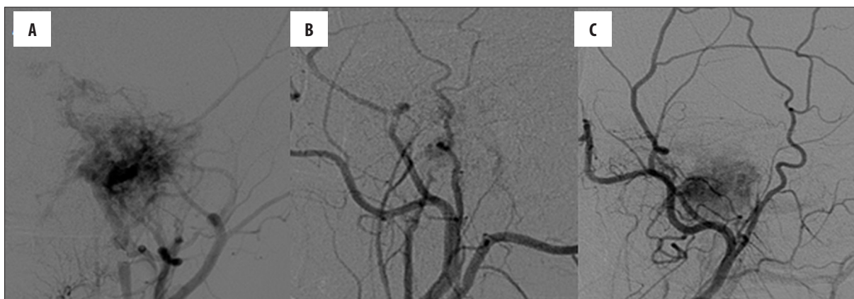
Figure 3. Left external carotid injection (A) presents a jugulo-tympanic paraganglioma tumoral blush. Two-staged embolization was performed with a subtotal effect of vascular occlusion (B). A control angiogram taken 13 months later revealed significant tumor revascularization (C).

is not curative [3,6,12]. As regards preoperative embolization through feeding vessels, its role is to decrease blood loss during surgical procedures and to help perform resections in a more secure manner [12–15]. In case of head and neck paragangliomas, both transarterial embolization with polyvinyl alcohol (PVA) particles and direct percutaneous embolization with n-butyl cyanoacrylate (NBCA) or ethylene vinyl alcohol polymer (Onyx) are used [16]. Either way, the procedure of presurgical adjuvant endovascular embolization is safe and effective, and the application of this form of therapy followed by surgical excision of paragangliomas is widely accepted [3,8,17]. In the literature, symptomatic treatment of paragangliomas is reported to be an alternative [3,6]. Paragangliomas are well-vascularized tumors and as a palliative treatment endovascular occlusion of tumor arterial supply is reported to have a positive impact on clinical symptoms including vertigo and tinnitus [3,13,17]. However, because of the multitude of arterial feeders and