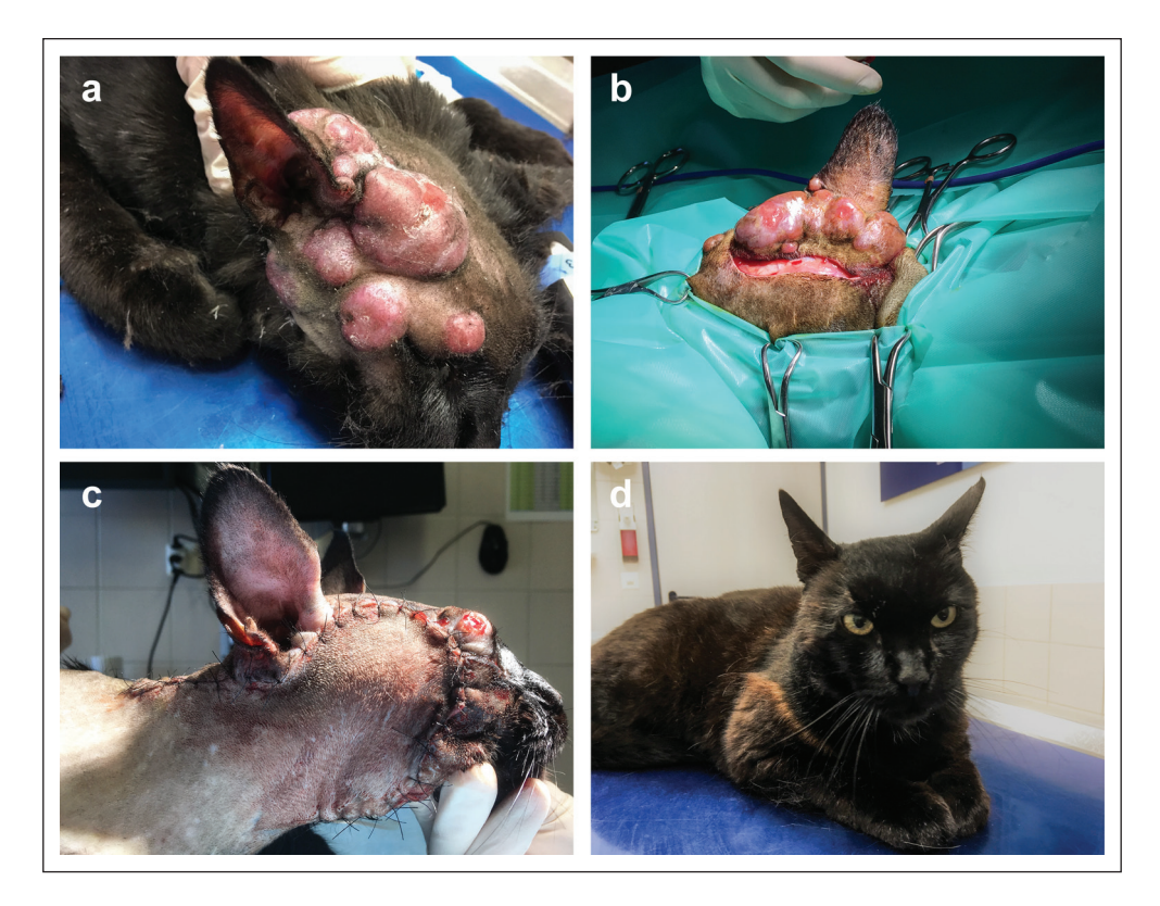
Figure 1 (a) Nodular skin lesions surrounding the base of the right ear and spreading along the right side of the face. (b) The first debulking procedure addressed the dorsal nodules on the medial side of the pinna. (c) During the second procedure the skin lesions on the side of the face were removed and the defect was closed with a myocutaneous advancement flap. (d) The wounds in the head region healed with almost no scar formation and no nodular lesions reappeared 6 months after treatment

therapy requires prolonged antimicrobial administration and, whenever possible, surgical debulking. In geographical areas officially recognised as bovine tuberculosis-free, like Switzerland, the risk of cutaneous tuberculosis in cats is very low. However, other members of the MTBC, for example Mycobacterium microti are, to date, recognised as zoonotic pathogens and may affect cats. Phenotypic susceptibility testing is strongly recommended for pathogens contributing to an infectious process that warrants antimicrobial therapy. In particular, susceptibility of mycobacterial species to antimicrobials cannot be reliably predicted uniquely based on knowledge of their genetic identity. §