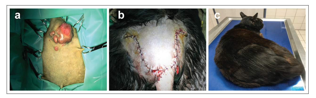
Figure 2 (a) Nodular skin lesions at the tail base. (b) The lesion extending to the spinous processes was excised completely and closed with a single pedicle advancement flap. (c) Healing of the surgical incisions was uneventful. Normal growth of hair was observed and no nodular lesions reappeared 6 months after treatment